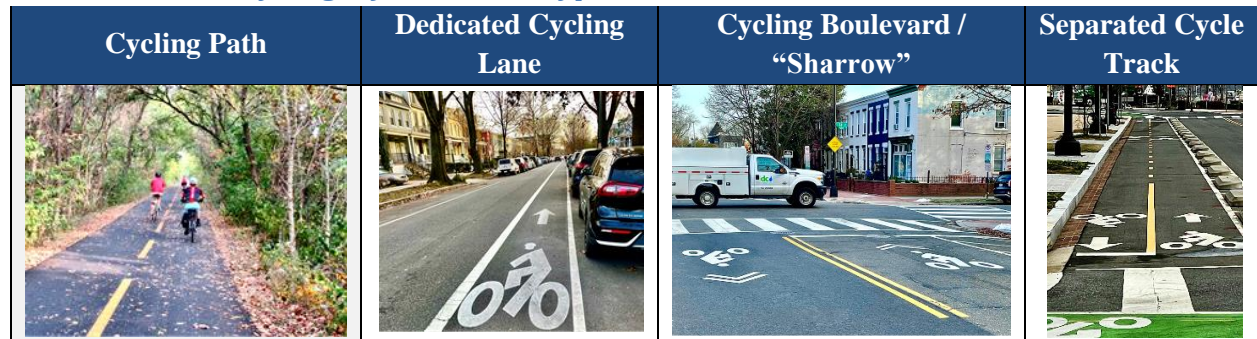
Table 2: Common Cycling Infrastructure Types

The monetization values in Appendix A, Table A-9 should only be applied over project sections for which a comparable parallel facility is not available, and only to miles cycled on the proposed project facility. Additionally, the estimated value per projected cyclist on a proposed facility should be capped at 2.38 miles, the average length of a cycling trip in the 2017 National Household Travel Survey, unless the applicant has specific documentation suggesting longer trips (as may be the case when a trip shorter than 2.38 miles is not feasible on the facility in question or on recreation-oriented facilities). In other words, applicants should not assume all cyclists travel the full distance of a proposed facility if the facility is longer than 2.38 miles, unless they have a clear justification for doing so, such as a detailed demand analysis or existing observations suggesting a different average trip distance.